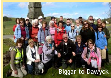
Biggar to Dawyck