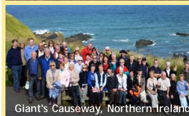
Giant's Causeway, Northern Ireland