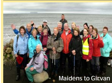
Maidens to Girvan