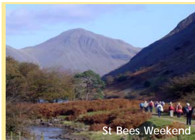
St Bees Weekend